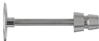
MK-CP 40 mm AC 265