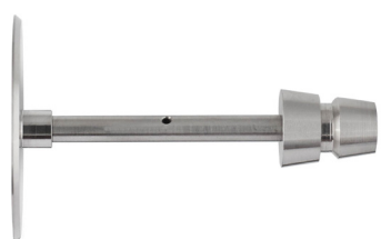
MK-CP 60 mm AC 265